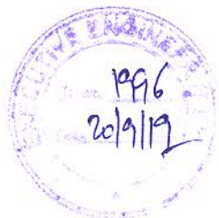
ASSISTANT COMMISSIONER (T)