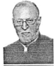
Anil Baijal Lt. Governor, Delhi