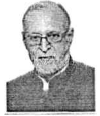
अनिल बैजल उपराज्यपाल, दिल्ली