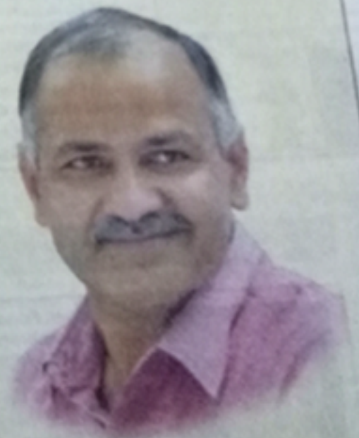
Manish Sisodia Dy. Chief Minister, Delhi

Applications will only be accepted online