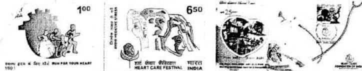
(National Postal Commemorative Stamps)