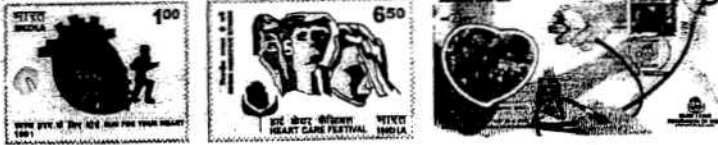
(National Postal Commemorative Stamps)