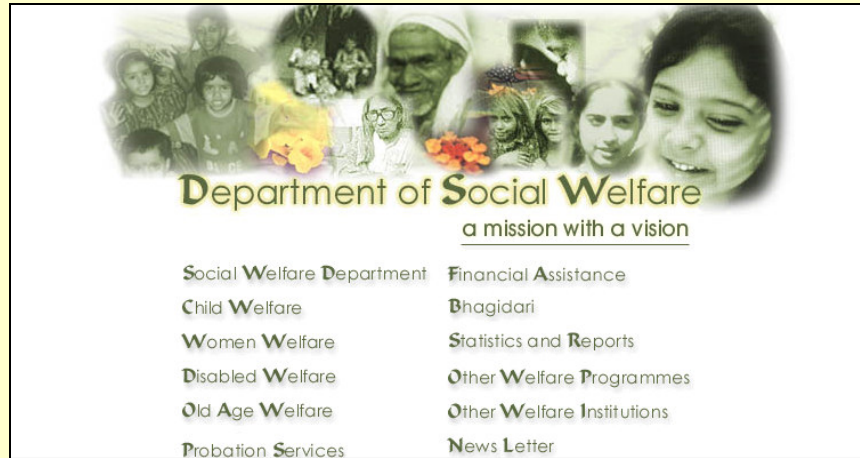
Screenshot of Website